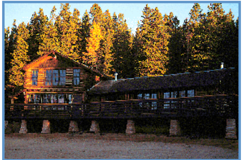
Figure 1. University of Colorado--Boulder Mountain Research Station. Photographer and date unknown.

Because the park is already in recreation heaven, there will be no need to build recreational facilities like a movie theater. The station needs to be located near an existing road but not visible from the main roads. Assume that the station will cover five to ten acres. How big is ten acres? An acre is about the size of a football field without the end zones. On the map at the end of these instructions, 10 acres would be a square about 0.2 mm on a side. If you made a dot with the sharpest pencil you could find, that dot would be larger than the field station’s area.