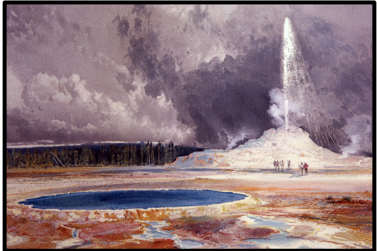
Figure 3. Castle Geyser, Upper Geyser Basin. Thomas Moran, undated.

In your professional opinion, is there an immediate (next 100 years or so) danger related to earthquakes at Yellowstone?