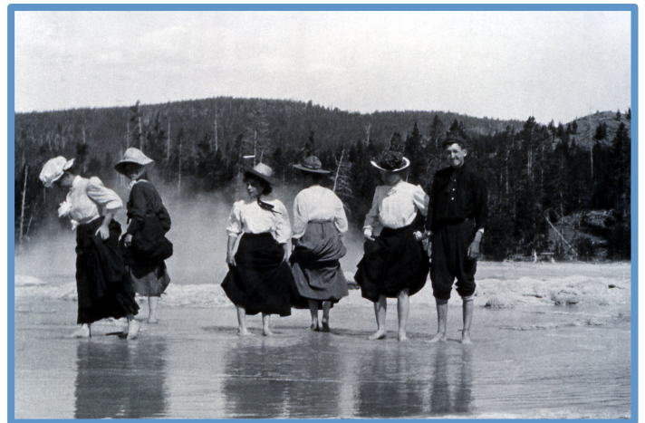
Figure 4. Tourists Wading in Great Fountain. Artist unknown, 1908.

Create guidelines for evacuation: Also, if you've been asked to do this, draft guidelines that will be used to decide if and when scientists (and tourists nearby) must be evacuated in order to keep them safe. How many guidelines and what kind of data you use is up to you. Consider saying something like, "If an earthquake swarm occurs and lasts for x months, then...." Or, "If geysers in a geyser basin begin erupting unusually, then...." Or, "If heat values seen on LandSat images exceed x, then...." (The last refers to data visible on Google Earth.)